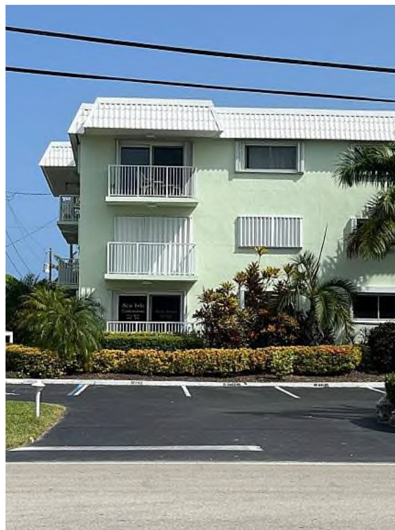
Thomas Lee Harding's vacation condo Sea Isle Condominiums 1101 West Ocean Drive #31 Key Colony Beach FL 33051